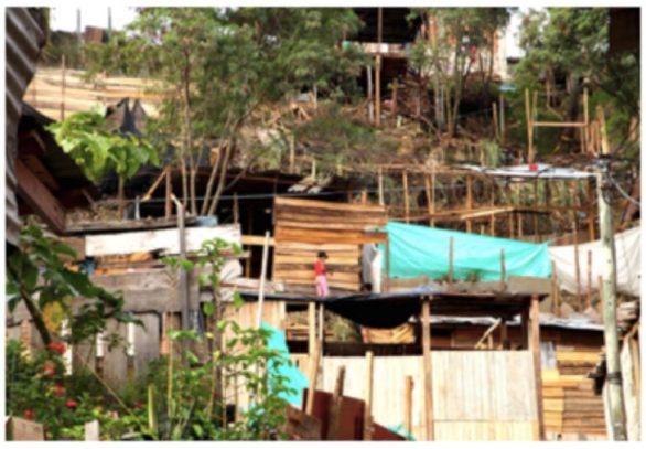
Figure 5. El Oasis, Moravia, Medellín, Colombia, 2015

Moravia, the outstanding example that has served to show off Medellín’s urban renewal and social transformation through culture, perfectly illustrated the wheel of history and the social tragedy in Colombia, with this occupation that resembled the sheer origins of Moravia itself.