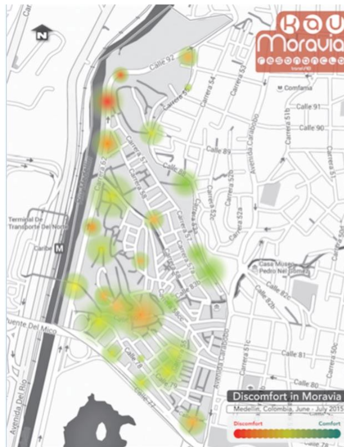
Figure 4. Collective visualization of discomfort, Moravia, Medellín, Colombia, 2015.

The cartographic visualization representing discomfort ( Figure 4 ) in the neighborhood marked in red a single area, which meant that this spot was rated with a discomfort level of 5 by the most of the participants who walked around that part of Moravia. As I hadn't visited that area myself we organized a group excursion to this spot. The area was known as 'El Oasis': a piece of sloping land of about 3 hectares, right next to the Medellin River. 'El Oasis' has quite a significant inclination and it suffered a fire in March of 2007 that burnt down 200 houses ("Incendio destruyó 200 viviendas," 2007). The area had remained vacant for years until it was occupied only a few weeks before the project began by a group of people who sought a dignified solution to their housing conditions. Among the settlers there are a large number of victims who had been forcibly displaced by diverse armed groups and who had had several confrontations with the police shortly after they secured their settlement in the hillside. It was easy to understand why this part of Moravia was marked by discomfort, and furthermore that this was the particular place that deserved a notch of urban acupuncture, namely, an ephemeral participatory intervention with its residents.