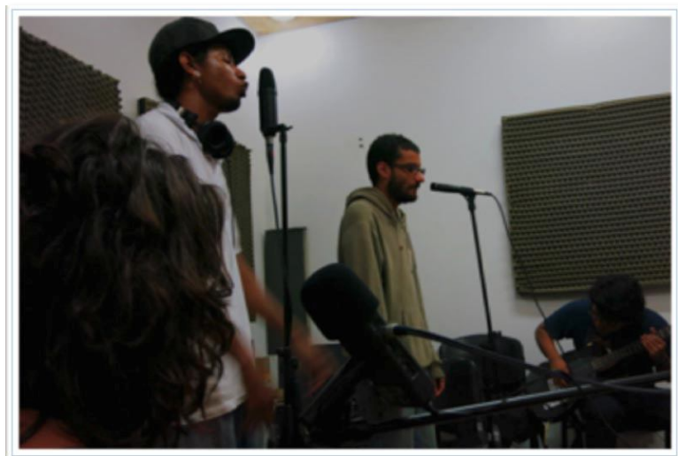
Figure 11. Centro de Desarrollo Cultural de Moravia, Medellín, Colombia.

Please take a look at the work carried out in Moravia in the following gallery: https://www.flickr.com/photos/resoundcity/sets/72157656315395399