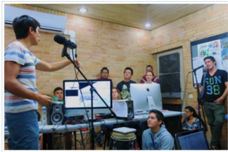
Figure 10. Centro de Desarrollo Cultural de Moravia, Medellín, Colombia.