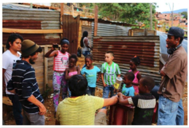
Figure 8. El Oasis, Moravia, Medellín, Colombia, 2015

The Bulla Lab group organized a two-week workshop for the kids in El Oasis, a fluctuating group of children between 4 and 12 years approximately, who waited eagerly for the Lab members to show up everyday at 4 pm. That so many members of the hillside community were musically driven impressed me. It was due to this apparent musical drive that our exploration ended up consisting of producing simple instruments from recycled objects provided by the ‘El Oasis’ community, in order to discover collectively their possibilities. Afterwards the assemblage was able to interpret some Caribbean folklore songs the children knew from memory. Simultaneously the Lab started facilitating the logistics for the adults to paint some more posters. This small experience was entitled ‘Bulla in Oasis.’