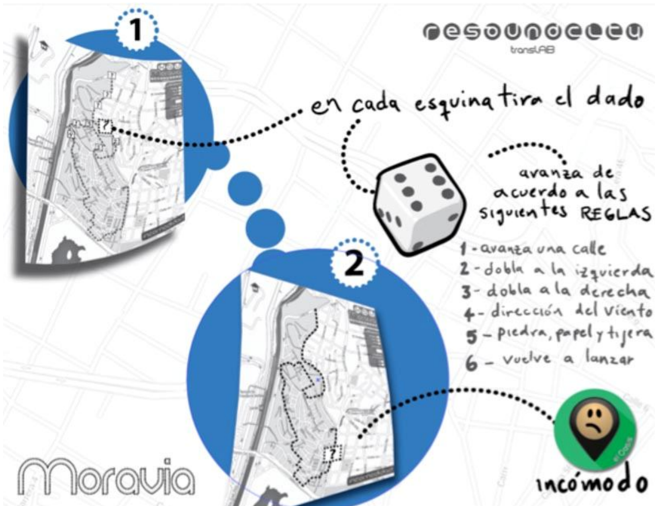
Figure 2. Infographic piece: instructions for using the dice, Moravia, Medellín, Colombia, 2015