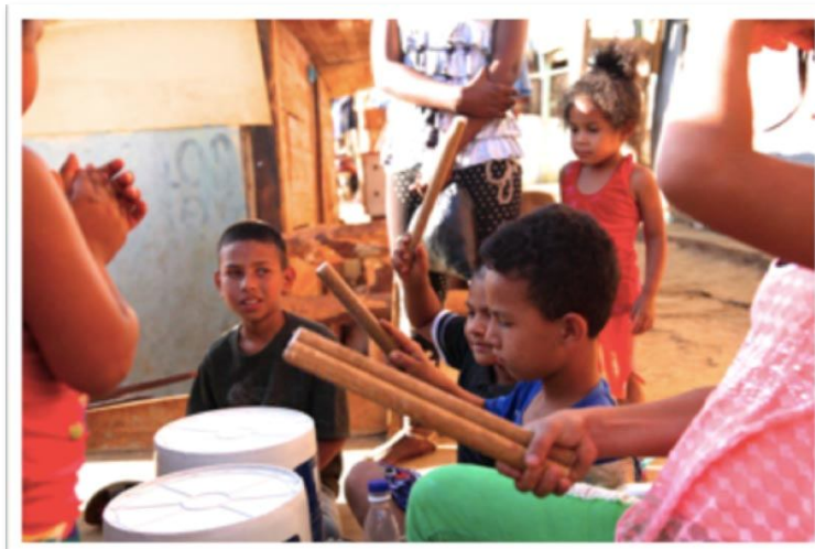
Figure 9. El Oasis, Moravia, Medellín, Colombia, 2015

Everyday, around 6 pm, the Bulla Lab got back from El Oasis to the CDCM where a simple recording studio was set up to rehearse some of the songs that started to take shape in of the common rehearsals where the residents played. Since the studio performances where intermingled with discussions about previous situations, some of the tracks contain neighborhood anecdotes and stories about the Bulla Lab itself.