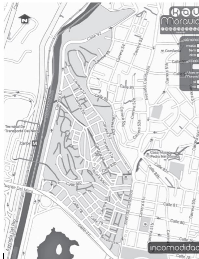
Figure 3. Moravia’s map: format for mapping discomfort, Moravia, Medellín, Colombia, 2015

The information to be gathered required walking alone and in groups of 4 participants for a period of two hours in each session. The whole group ended up carrying out 6 walks using the cartograms, writing down in our formats those places in the neighborhood where each participant felt uncomfortable or unsafe, for any reason, using a scale of 1 to 5 to indicate the intensity of the discomfort, where 1 implied being slightly uncomfortable and 5 extremely uncomfortable. Each shared journey ended with an assembly where all the participants discussed their interpretations and uploaded the information to a database using the computers at the cultural center. To accomplish this I gave a series of short lessons to show how to set the entries collected in each format to an online database.